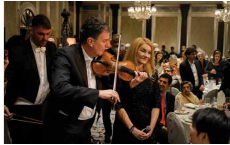
The BPO presented Zubin Mehta with his favourite hot sauce from Serbia – ajvar – and gave an impromptu performance of Serbian folk music.